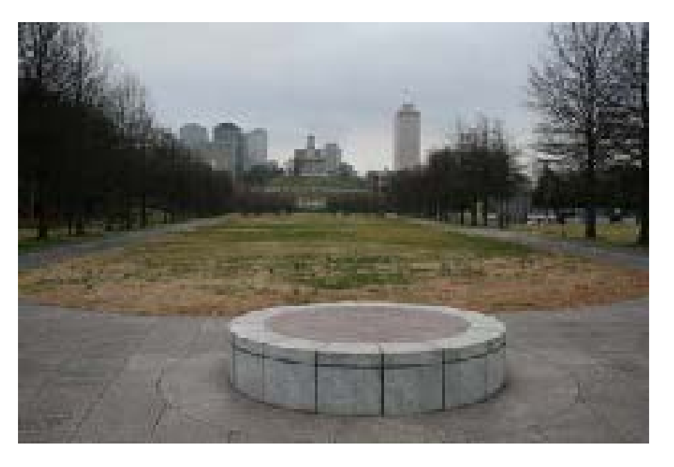
Show site with the state capitol building in the background (above) Show site with the food court in the background (below)